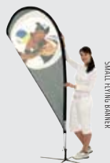
SMALL FLYING BANNER